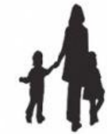
Stroud Beresford Group